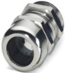
Cable gland, Cable gland material: Brass, nickel-plated, External cable diameter 5 mm ... 10 mm, Shielding: yes, Connecting thread: Pg11, Color: silver

Please be informed that the data shown in this PDF Document is generated from our Online Catalog. Please find the complete data in the user's documentation. Our General Terms of Use for Downloads are valid ( http://phoenixcontact.com/download )